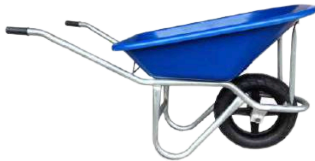
90L (Plastic tray)