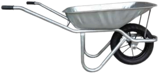
50L (Steel tray)