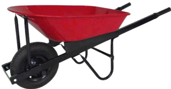
80L (Steel tray)