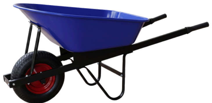
120L (Steel tray)