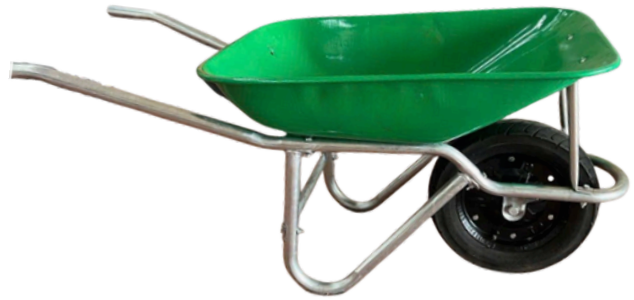
70L (Steel tray)